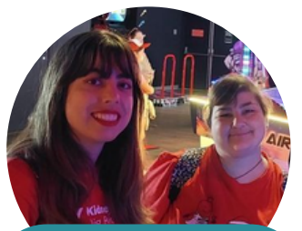
Kidney Knowledge Centre

Providing children and their families a safe space to connect, share experiences, and build lasting support networks. These camps foster resilience, enhance social skills, and provide a sense of community for children who often feel isolated due to their condition.