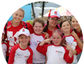
Peer support & mentoring

This is achieved through the following programs: